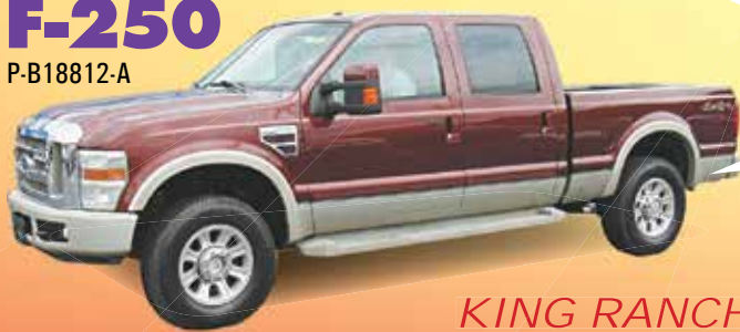
2008 FORD F-250 P-B18812-A