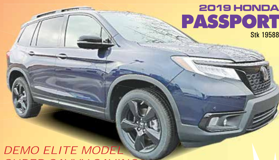
2019 HONDA PASSPORT Stk 19588