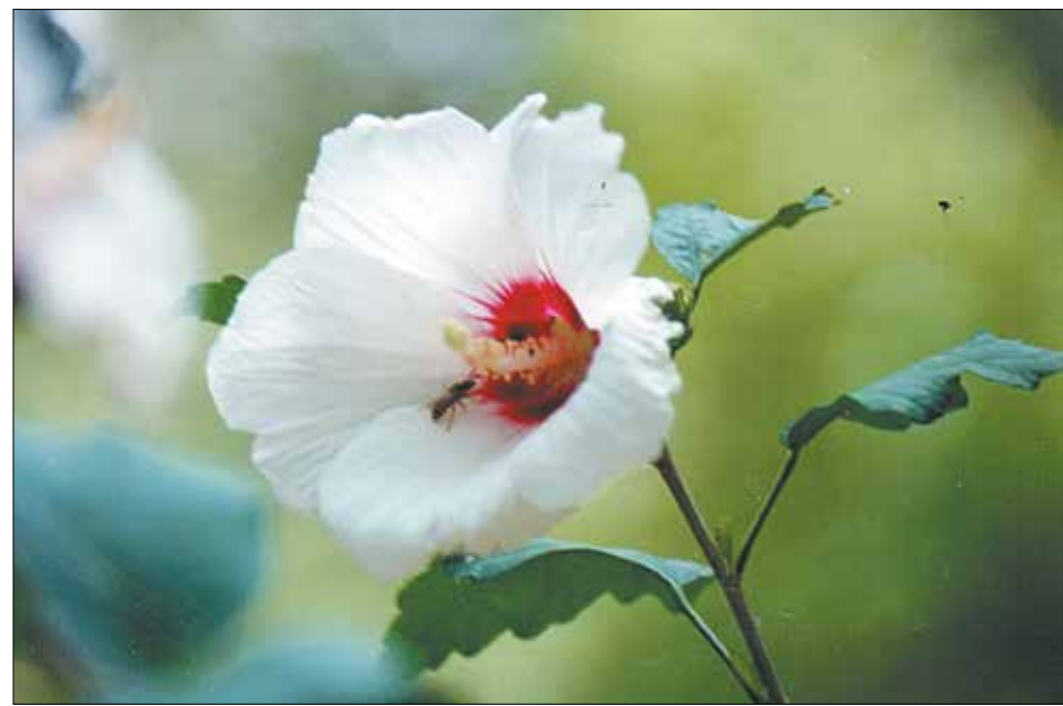
Picture of Rose of Sharon