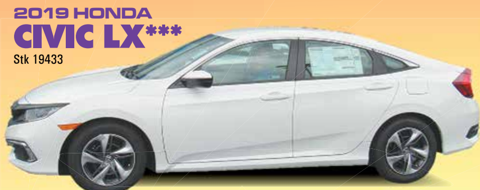
2019 HONDA CIVIC LX*** Stk 19433