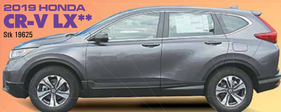
2019 HONDA CR-V LX** Stk 19625