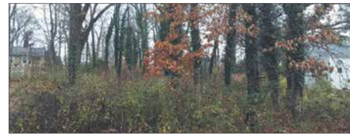
FOUNTAIN CITY - TWO RESIDENTIAL BUILDING LOTS IN THE HEART OF FOUNTAIN CITY IN WELL-ESTABLISHED SUBDIVISION. PRICED AT $19,900 EACH. MLS 1073459