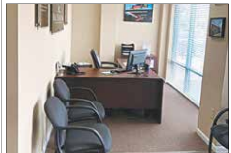
COMMERCIAL OFFICE SPACE FOR RENT IN THE HEART OF FOUNTAIN CITY $1500 PER MONTH - 5 OFFICES, RECEPTION AREA, CONFERENCE ROOM! LEVEL ENTRY - NO STAIRS! 5034 N Broadway St MLS 1089989