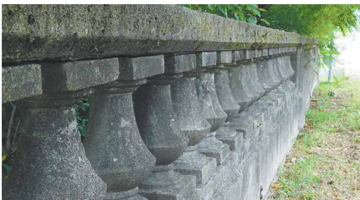
The odd pillars of the walls above the Mineral Springs Bridge and the two arches below make the old span beautiful and historic. Built in 1910 as the area was developing as an entrance to the historic Whittle Springs resort area, the new bridge is longer but may resemble the current one a bit.

He said his department has been nicknamed "Future Crimes" and talked