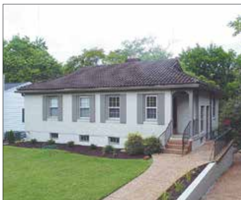
JUST LISTED! EMORILAND BLVD IN UPTOWN NORTH KNOXVILLE! $249,000. 1915 Emoriland MLS 1090276