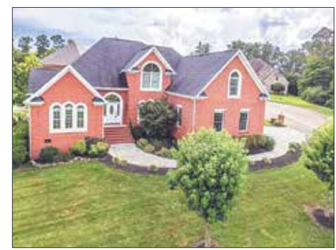
REDUCED - BEST BUY IN FARRAGUT! $479,000. 544 Cumberland Ridge Dr, Farragut. MLS 1055150