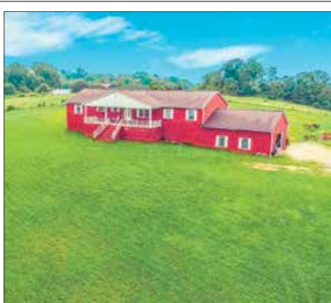
CORRYTON! 19.7 ACRES & BRICK BASEMENT RANCH $525,000. 7005 Fairview Rd. MLS 1088497