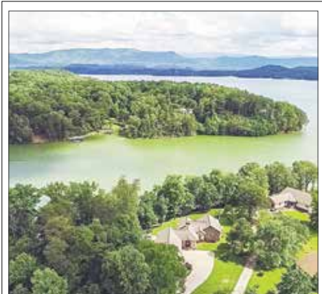
LAKEFRONT BASEMENT RANCH IN DANDRIDGE! $765,000. 1174 Lake Ridge Dr. MLS 1080414