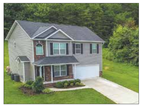
JUST LISTED! OFF WASHINGTON PIKE $225,000. 3118 Whelahan Farm Rd MLS 1090275