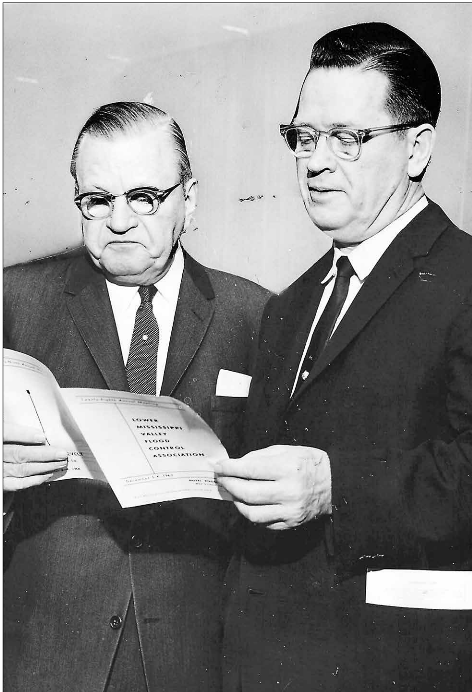
Congressmen Cliff Davis of Tennessee (left) and Jamie Whitten of Mississippi in December of 1963.

friend" of Cliff Davis and the owner of the Broadway Drug Company, hosted a luncheon where the congressman explained his vote for the recent pay raise bill for members of the House. "I predict the day may well come when only wealthy people will be able to run for Congress because of the expense of running for office and living in Washington," Davis said.