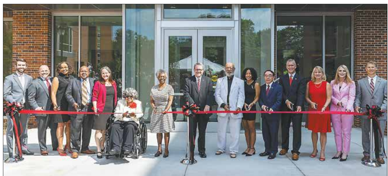
University officials and honorees cut the ribbon on the newly constructed Black-Diallo-Miller Hall.