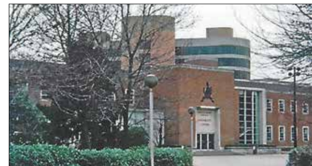
Picture of the Carolyn P. Brown Memorial Student Center at The University of Tennessee in the 1970s

In the basement of the student center on Cumberland Avenue, there was a bookstore, the popular Smokey's cafeteria-style restaurant, and Rafter's restaurant where I often stopped by on my walk to work on Main Street. It was a place where I could always pick up a copy of The Daily Beacon student newspaper. The bowling lanes where I signed up one quarter to fill class credit were also in the basement. Meeting rooms,