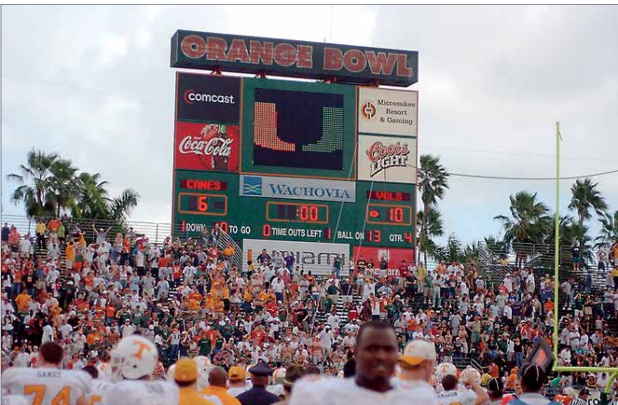
The scoreboard tells the tale as Tennessee defeated Miami on Nov. 8, 2003. Football Time in Tennessee.

Expectations have always been high around Tennessee football. Fans find out very quickly that this is Tennessee football... and the future is now. Vol fans have streamed to Neyland Stadium and other venues in increasingly record numbers. Neyland Stadium is awash in fans wearing varying shades