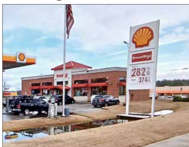
The replacement of a gas price sign was voted down by Knoxville City Council following the appeal of a Board of Zoning Appeals decision. The sign is in the middle of a drainage ditch and apparently will continue to have its prices changed manually.

Although the Board of Zoning Appeals voted to allow the station to reduce the minimum street frontage from 250 feet to 174 feet, the council voted unanimously to approve the appeal and forbid the change.