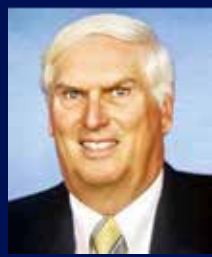
By John J. Duncan Jr. duncanj@knoxfocus.com

When Kamala Harris was running for the 2020 Democratic presidential nomination, she responded to an ACLU questionnaire saying she favored transgender surgery for prisoners at taxpayer expense. In a separate television interview, she said, "As (California) attorney general, I pushed the California Department of Corrections and Rehabilitation to provide gender transition surgery to state inmates." In that interview, she added that this would further her "agenda" and