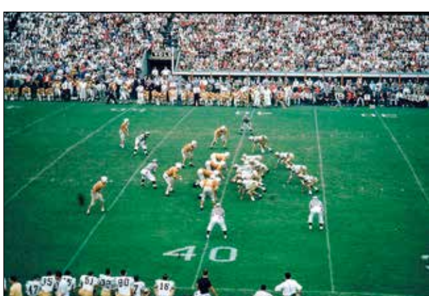
No. 8 Tennessee and No. 3 Georgia Tech squared off on Shields-Watkins Field on Oct. 10, 1959. By the way, how many players are on the field wearing orange jerseys?

This was always a great series overall. The games had a special "feel" to them, not only weather-wise, but