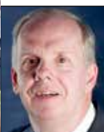
By Tom Mattingly

Looking at this year's Vol football schedule begs an important question for us old timers.