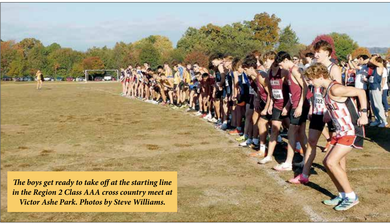
The boys get ready to take off at the starting line in the Region 2 Class AAA cross country meet at Victor Ashe Park.