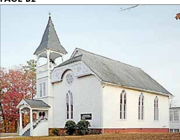
Shannondale Presbyterian Church, located at 4600 Tazewell Pike, holds weekly worship and is also available for weddings. The sanctuary is warm and inviting and they have kitchen facilities.